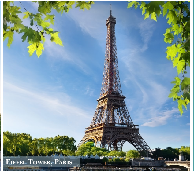
EIFFEL TOWER, PARIS