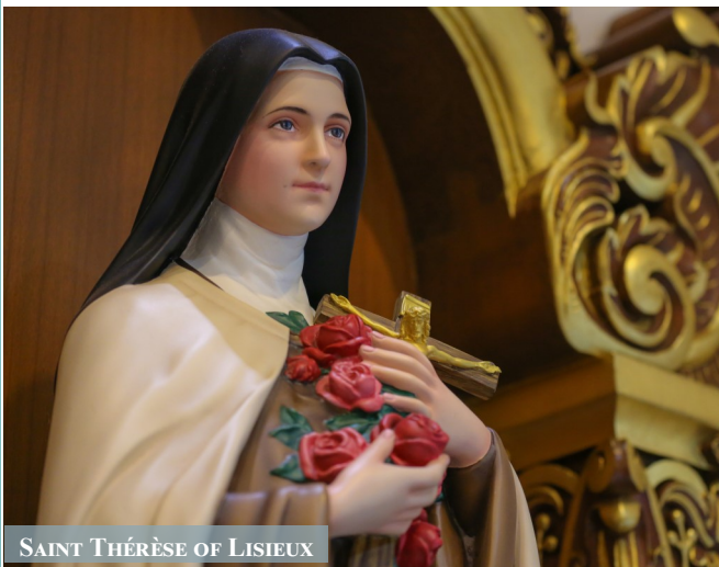
SAINT THÉRÈSE OF LISIEUX