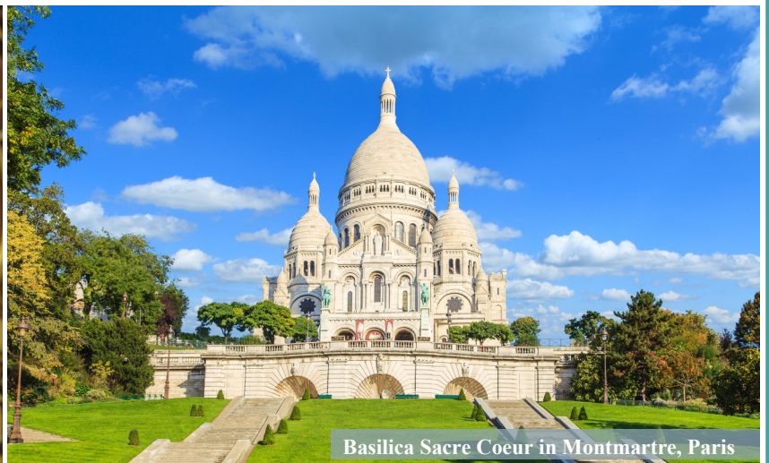
Basilica Sacre Coeur in Montmartre, Paris